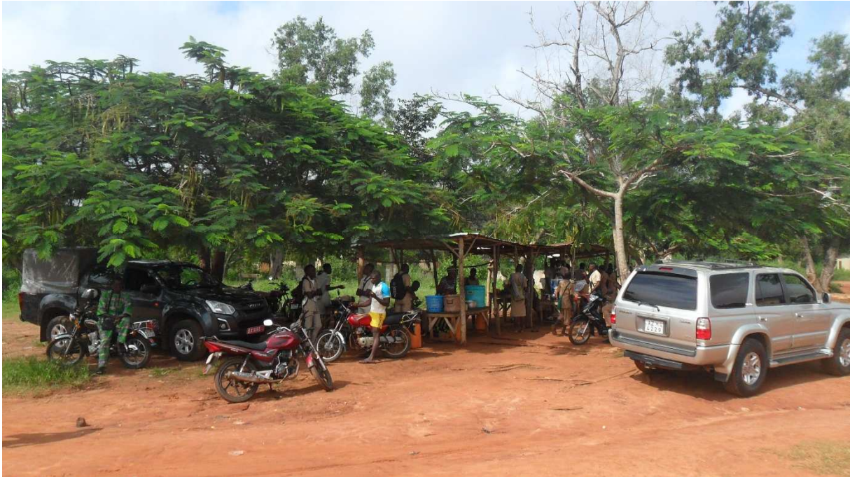
Food sellers and students in front of the CEG1 of Aplahoué