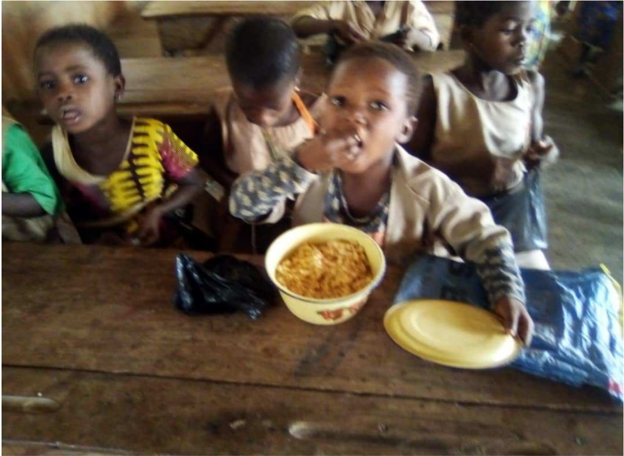
Schoolchildren enjoying the food served