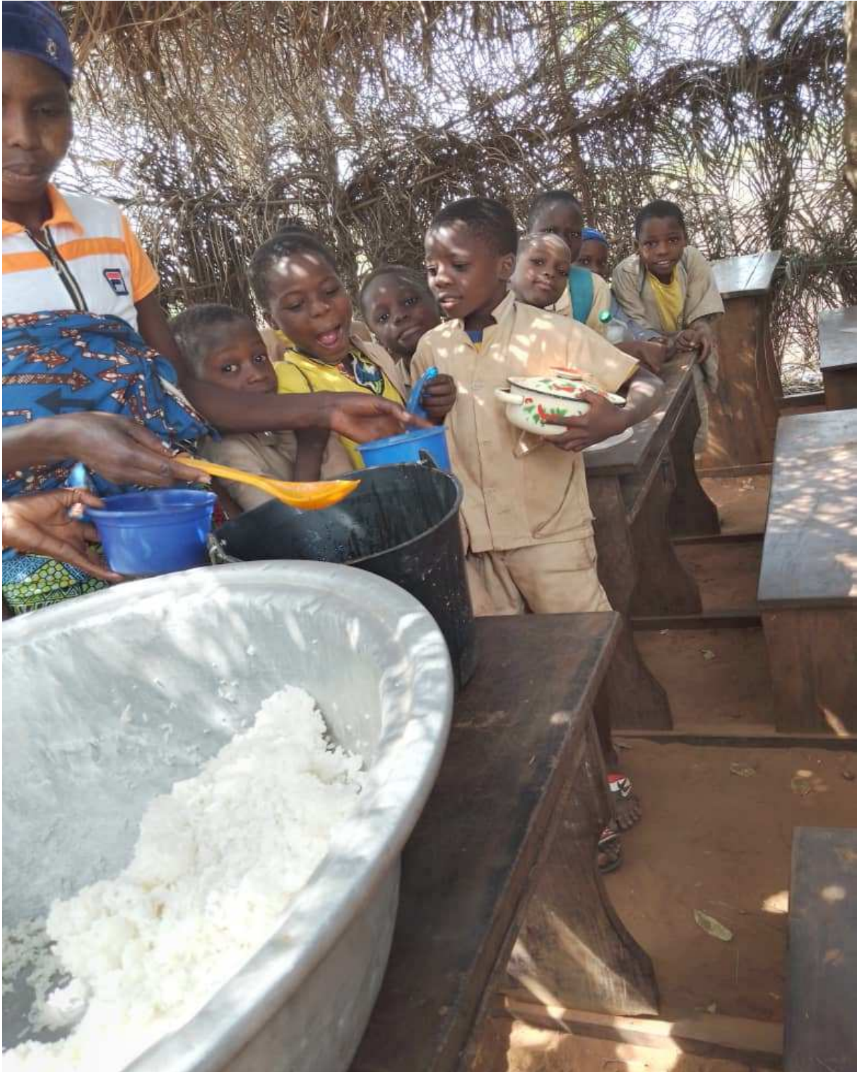
Meal distribution session to schoolchildren