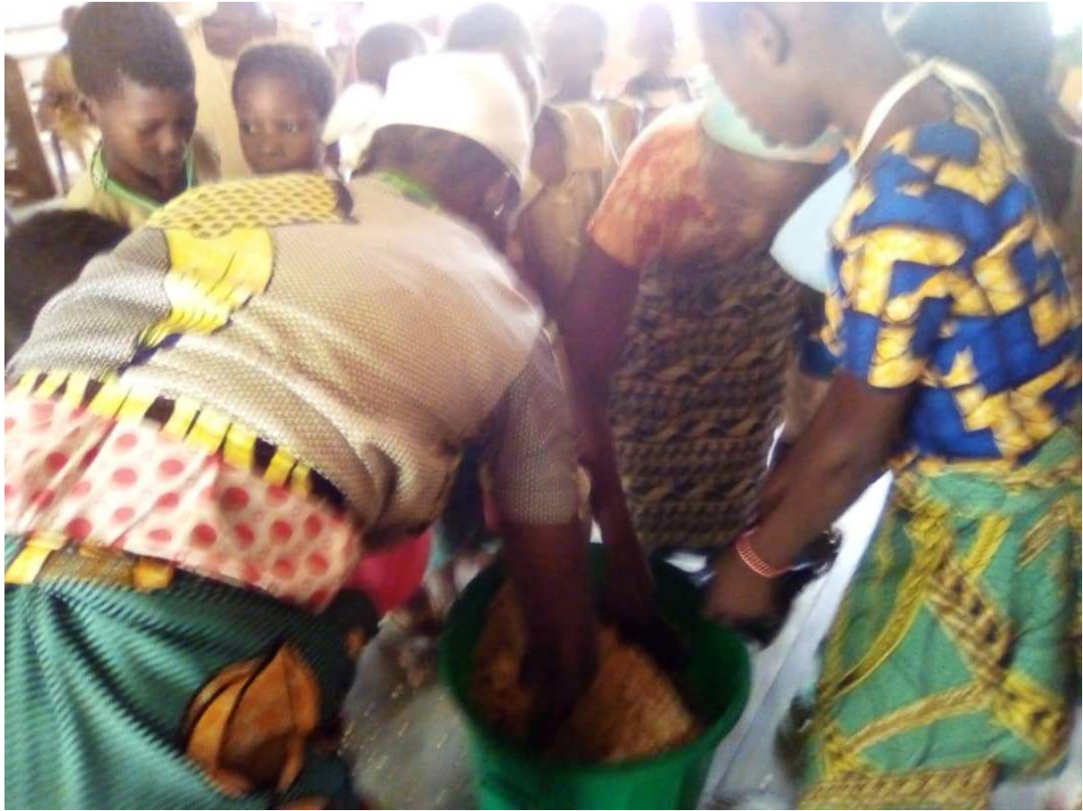
Distribution of meals to schoolchildren at Kpodaha school