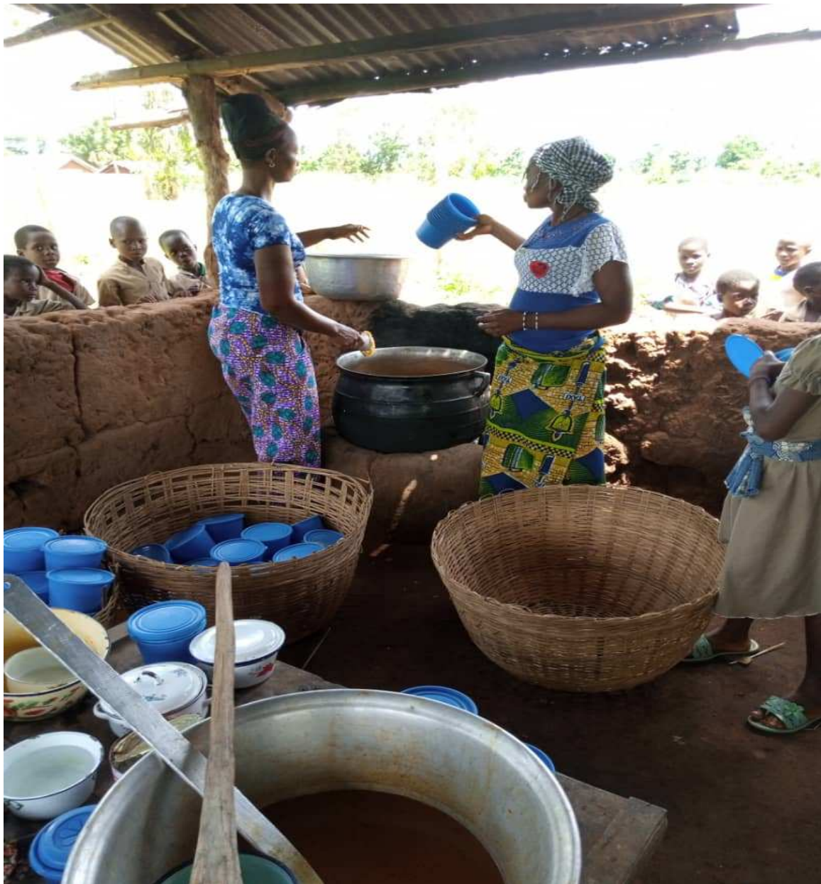
Enriched meals ready at the Séguémey school kitchen

Those in charge of the public primary school at Séguémey learned about the activities of ONGED and began by expressing their needs for the canteen of their school. The eternal problem is that of the contribution of 25 F CFA per student. The food can exist without the necessary condiments to prepare nutritious meals for the children, because of the lack of money. This is the critical situation that prevailed when the call for help was made to ONGED.