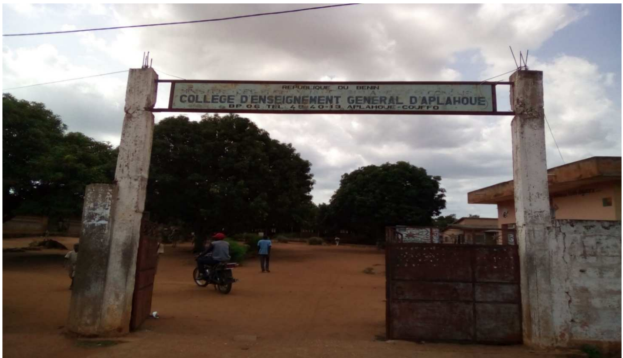
Old façade with crumbling wall of the CEG1 of Aplahoué

In the former department of Mono, there was only the Collège d'Enseignement Moyen (CEMG) Général d'Aplahoué, which was the largest of all: students from the CEMGs in the communes of Klouékanmey and Djakotomey and elsewhere came there to take the BEPC exams. It was the only examination center in the north of the Mono department. Over time, bad weather has degraded everything in the CEMG, which became CEG1: erosion is ravaging the buildings: the walls and roofs of the classroom modules are ruined, and many of the tables and benches are out of use. The users of the CEG are insecure because of the state of the buildings and the walls used as fences which, moreover, are collapsing in places.