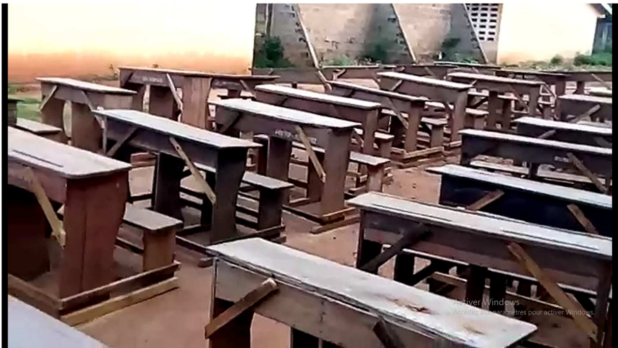
Part of the desks repaired for the CEG1 of Aplahoué