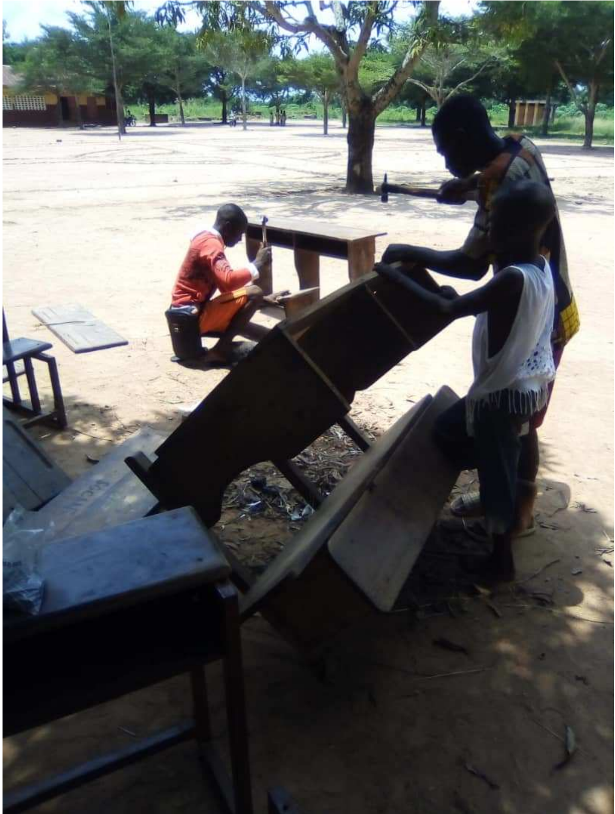
ONGED repairs spoiled desks at the school of Kpodaha

This school complex does not have a canteen. To help its schoolchildren until the authorities give them a canteen, ONGED gives them food at times, especially as living has become very expensive since there is a