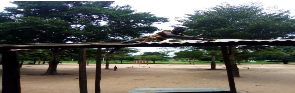
Carpenters are building a shed at the Kpodaha school for ONGED