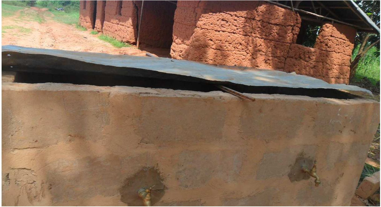
Water point provided to the public elementary school of Solouhoué DOGBO