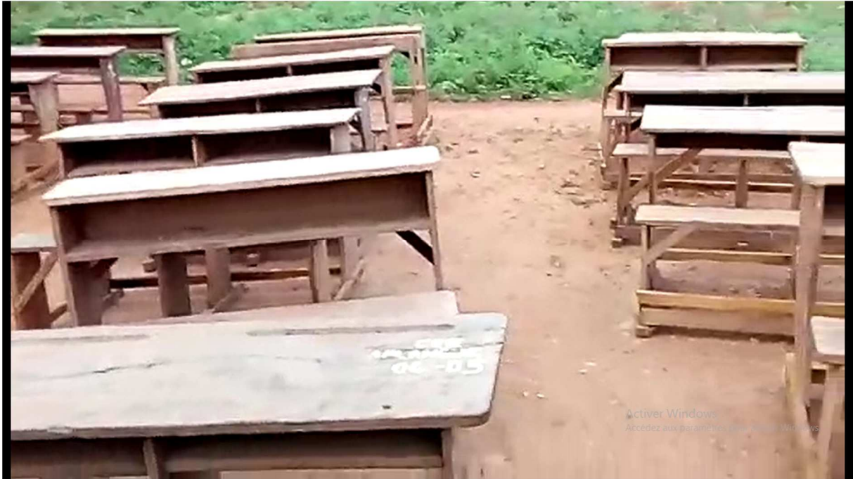
Other desks repaired for the CEG1 of Aplahoué (Benin-Afrique)