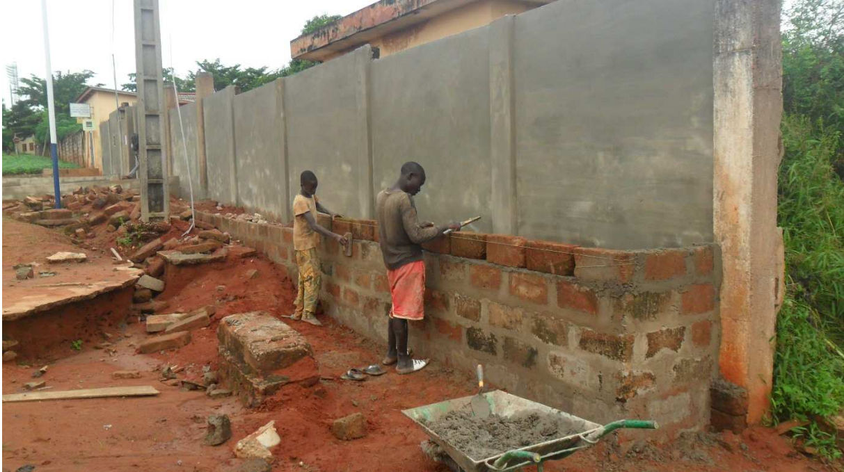
Mason at the service of the ONGED to rebuild the wall of the facade of the CEG1 of Aplahoué

The gate was also spoiled and did not close well, another one was needed. With the dynamism of the Director of CEG1, the ONGED contributed to the making of another metal gate which is of much higher quality than the existing one.