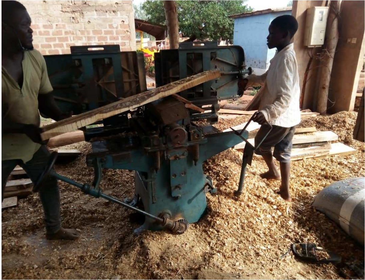
Carpenters at work repairing the desks