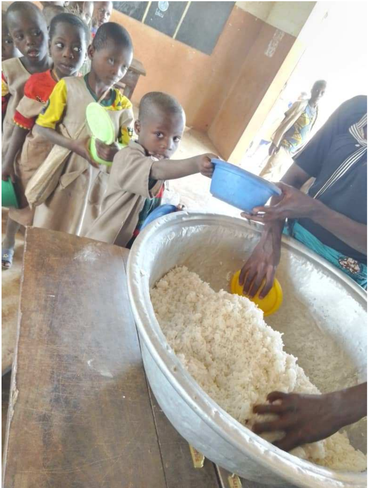
Distribution of nutritious meals to school children at the EPP of Solouhoué