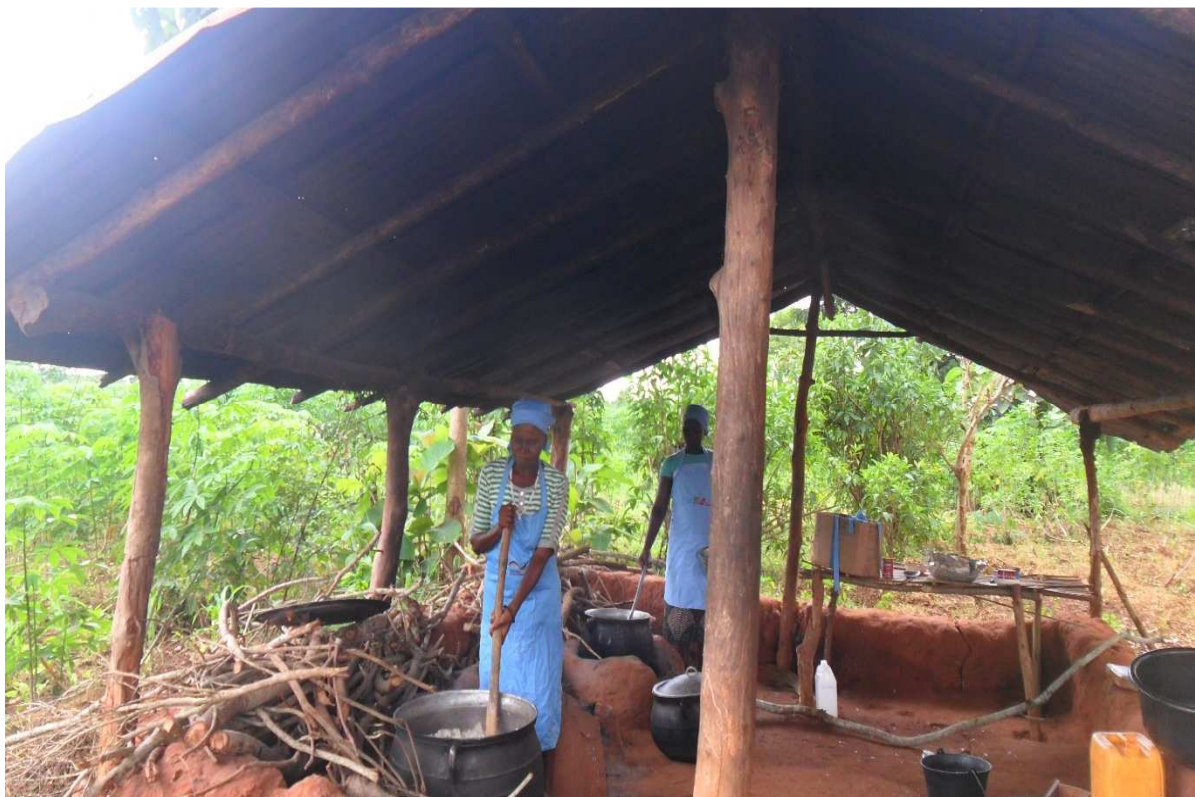
Cooks in the kitchen for the school canteen of Solouhoué

All the schoolchildren are not able to pay the contribution for the canteen. Of course, those who did not pay 25 F per day did not have to eat, but they are the most miserable: they do not even have 25 F (25 F = $ 0.04318 USD) to spend each day! This is the extreme poverty that the government is trying to remedy. Since then, ONGED has paid for all the students to have food and for the quality of the meals to be assured.