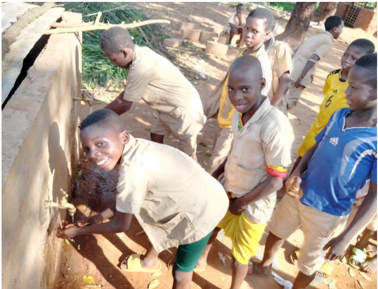
Schoolchildren happily using the water of ONGED at the public school of Solouhoué