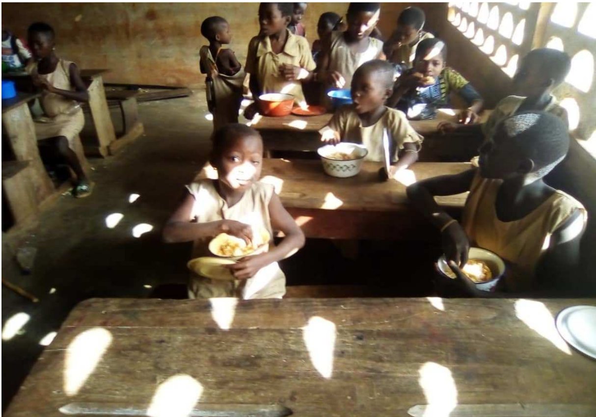
Schoolchildren of Kpodaha school enjoying the food given