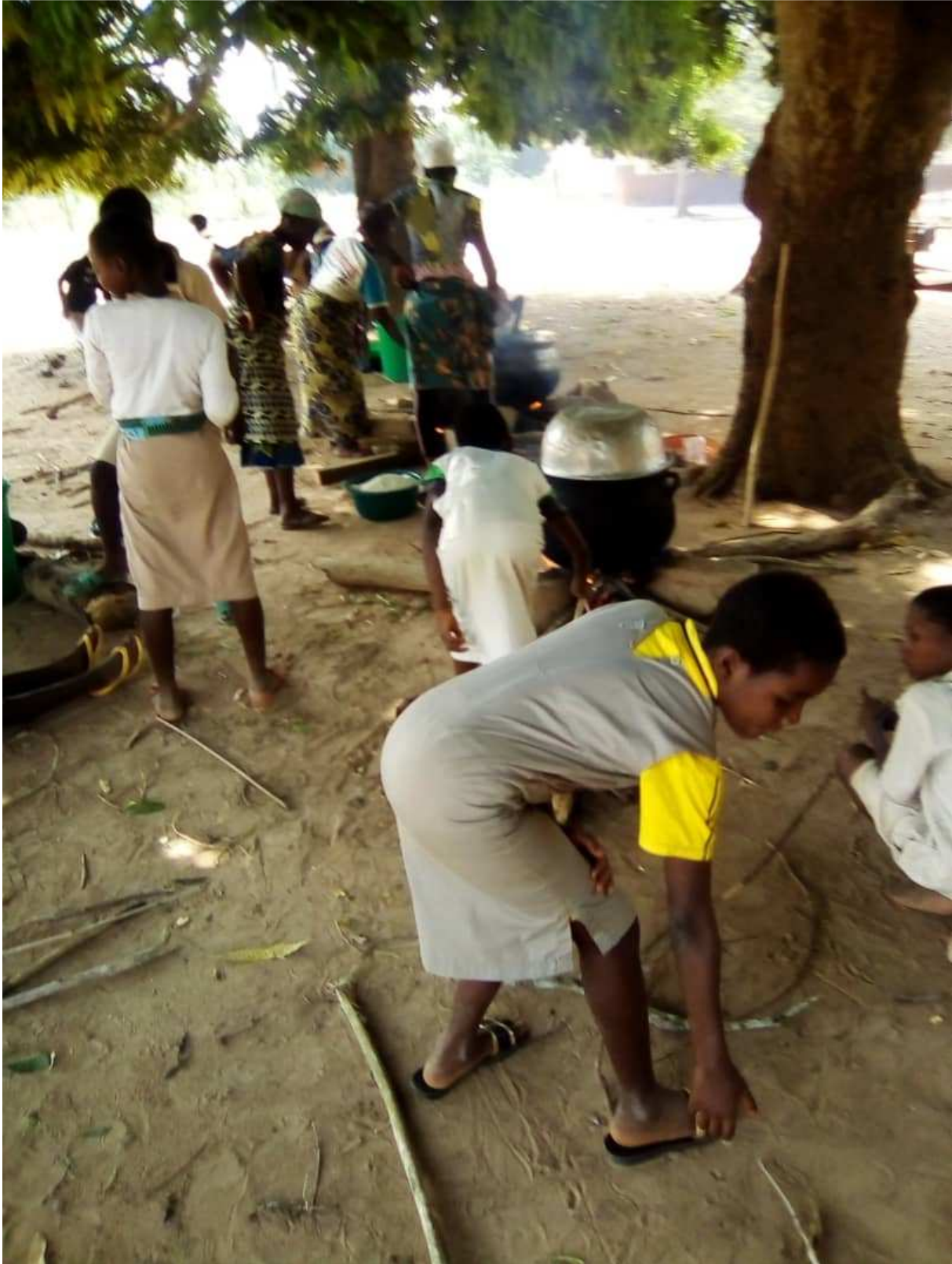
Canteen created for the school of Kpodaha by ONGED while waiting for the one of the government.

shortage of food because of the previous drought and especially because of the effects of the covid-19 pandemic.