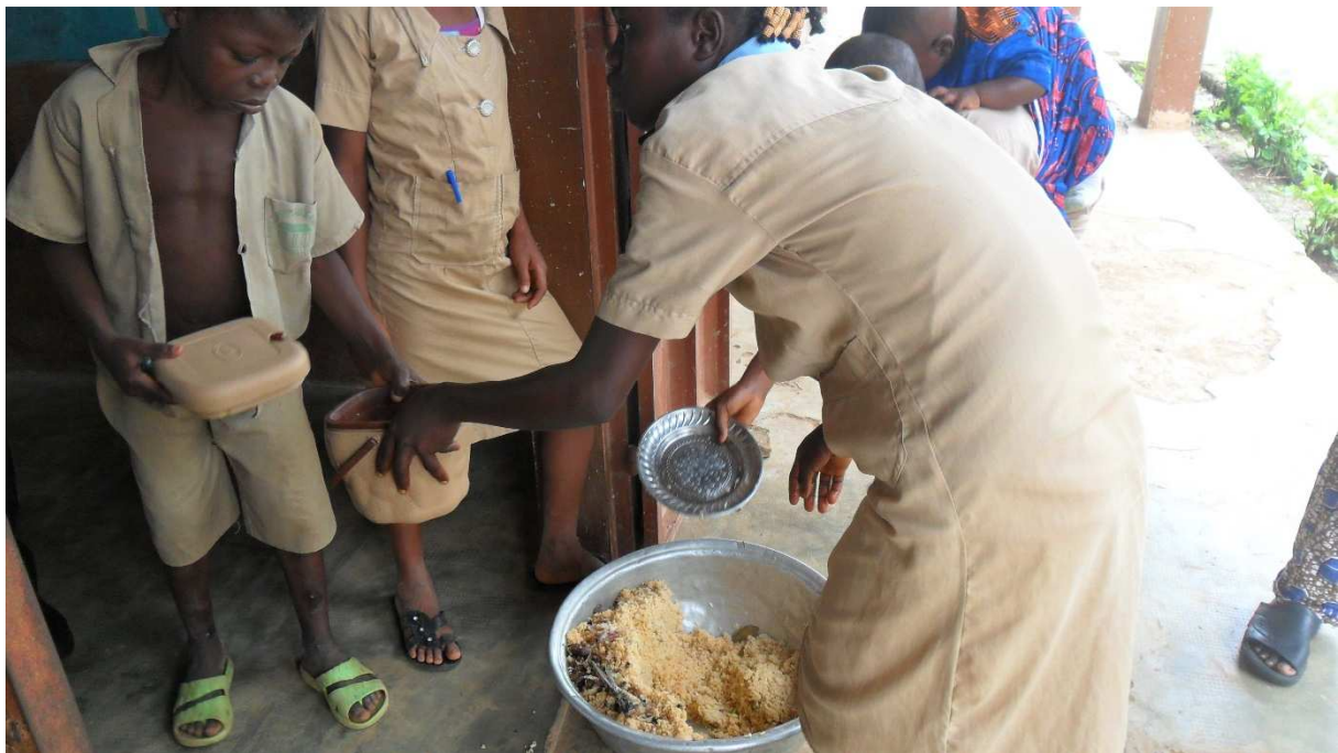
Distribution of meals to schoolchildren at Kpodaha Public Primary School Benin