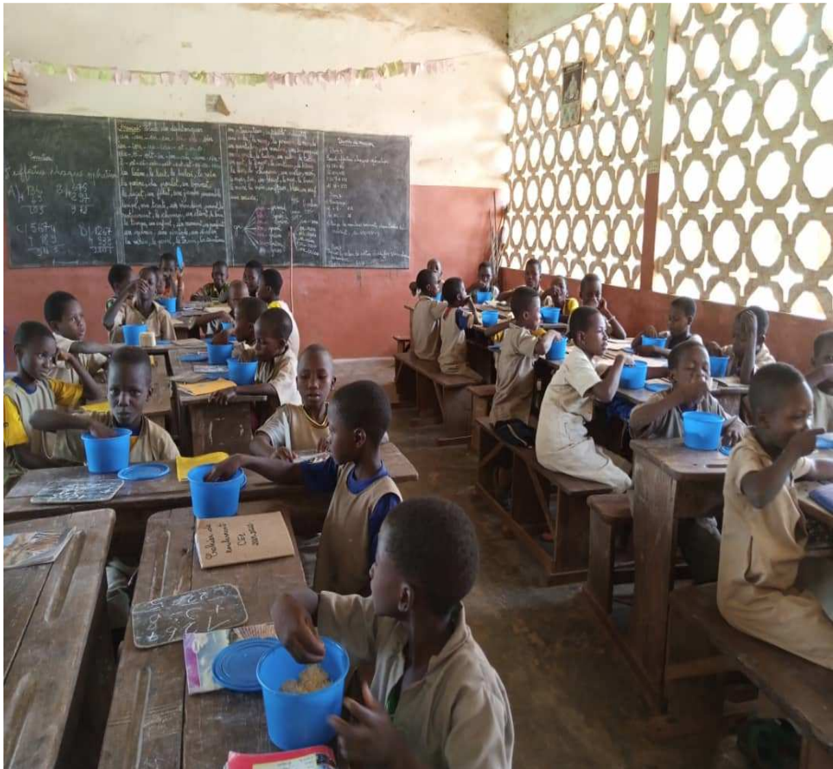
Schoolchildren enjoying a meal at the public school of Seguemey in Benin (Africa)

When ONGED officials arrived at the school, the director reported on the contributions of the students more than two (2) weeks after the beginning of the school year. He said that out of the 298 students enrolled in his school, only 17 have been able to pay 25 F each.