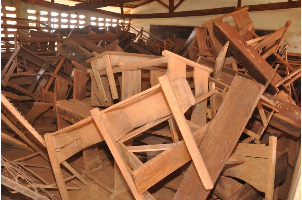
Hundreds of spoiled desks crammed into classrooms