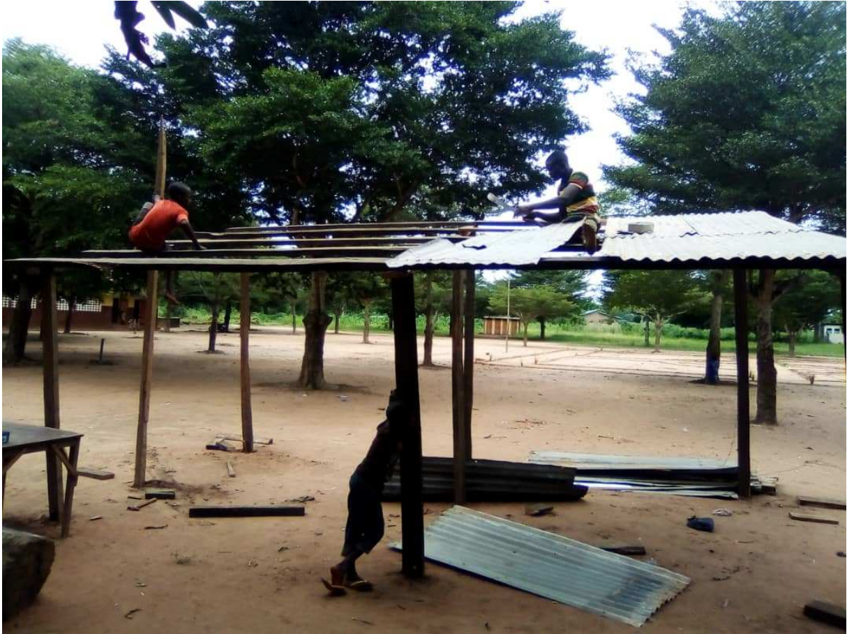
Shed under construction for food sellers at Kpodaha school

The public school complex in Kpodaha told ONGED that it lacked a shed where vendors could stay to sell food to schoolchildren. Rain, sun and debris disturb these vendors. When they are under the trees, animals threaten them with droppings that fall from the trees, soiling the food. So, ONGED built a shed in the establishment.