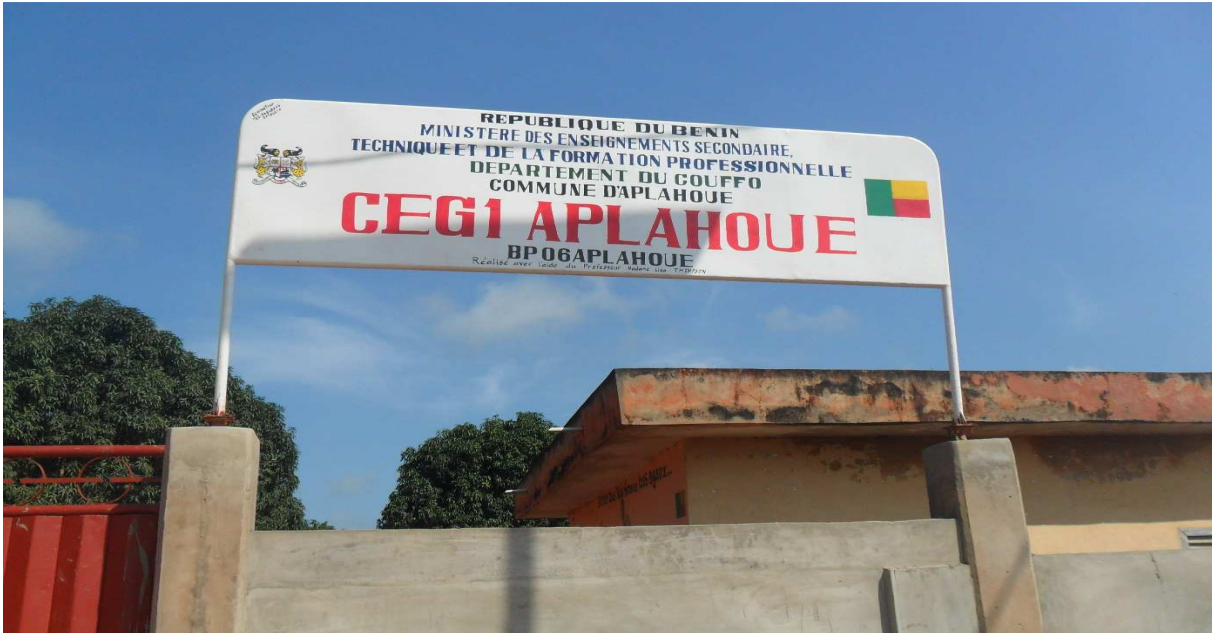
Partial view of the new façade of the CEG1 of Aplahoué