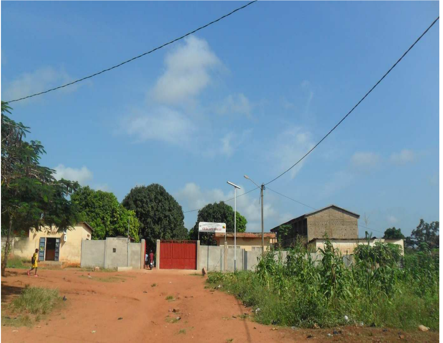
New façade of the CEG1 of Aplahoué

Moreover, the exam period coincided with the time of food crisis. The rain stopped falling. Everything that is sown or planted suffers from the lack of rain. The price of foodstuffs soared. Famine began to occur.