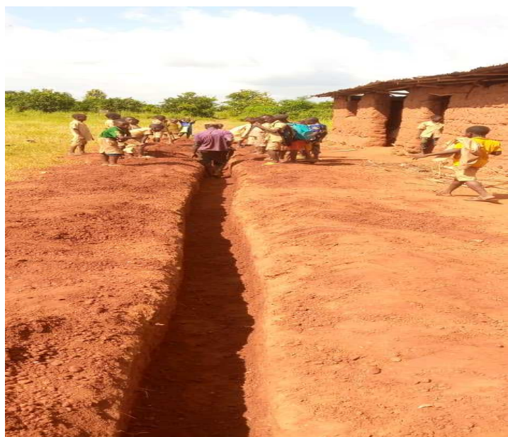
Workers at work for NGO EDUCATION AND DEVELOPMENT at EPP Solouhoué