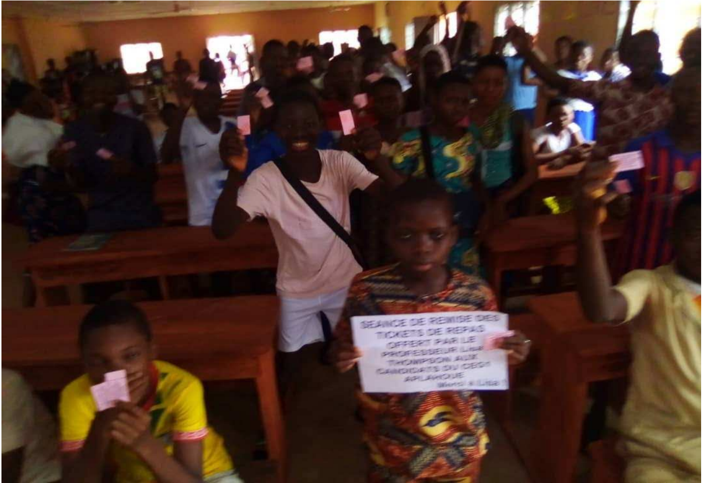
Student candidates displaying tickets received for catering during the end-of-year exams at CEG1 in Aplahoué

But much remains to be done for the CEG1 of Aplahoué ; for example how to put into full operation its computer room, its library and its water supply system. There is no need to say that there are schools that lack water. This is also the case for some public primary school, including the one at Solouhoué.