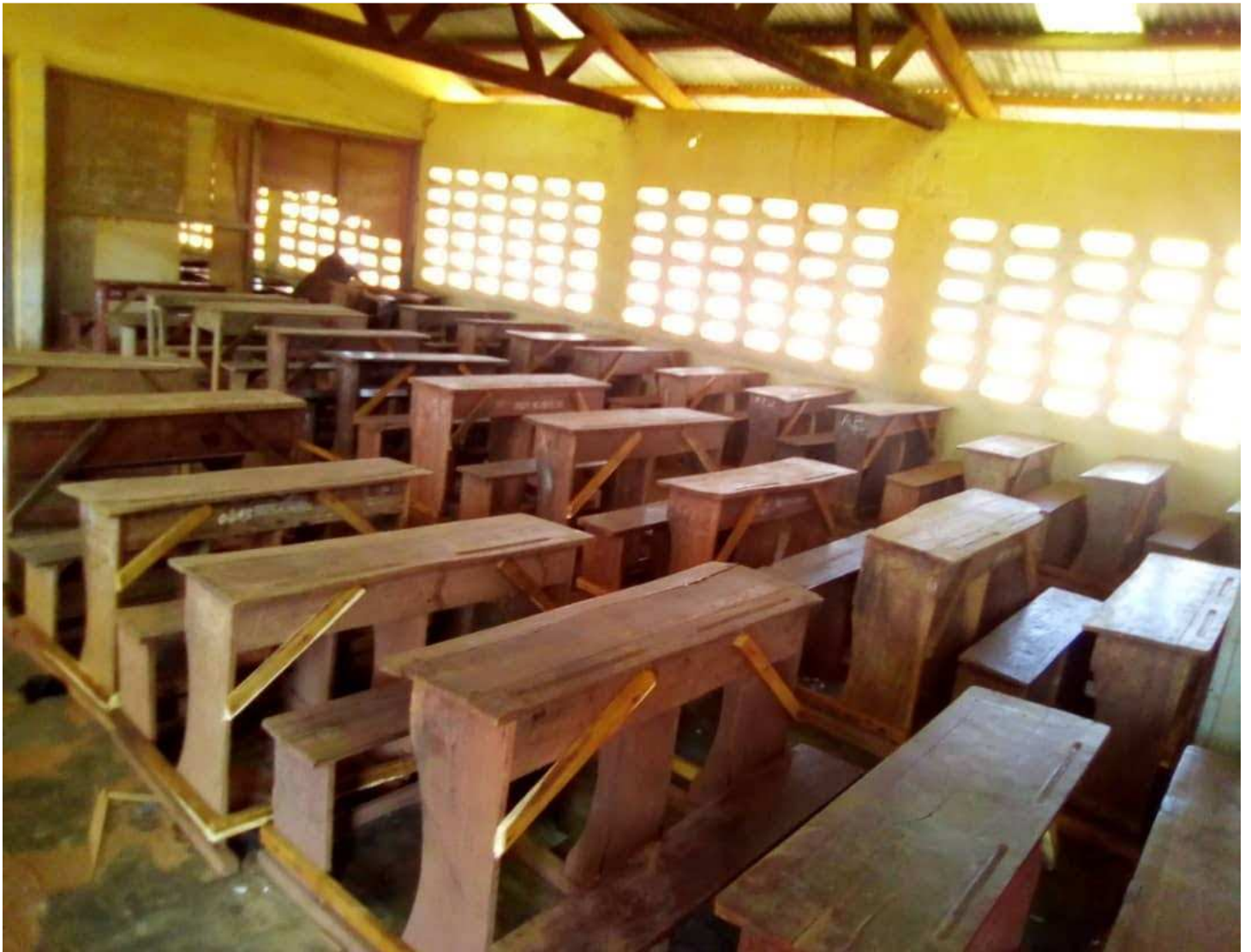
Some desks repaired and stored in a classroom at CEG1 in Aplahoué

and creating a good state of mind for the candidates was good for them to give the best of themselves at these different exams.