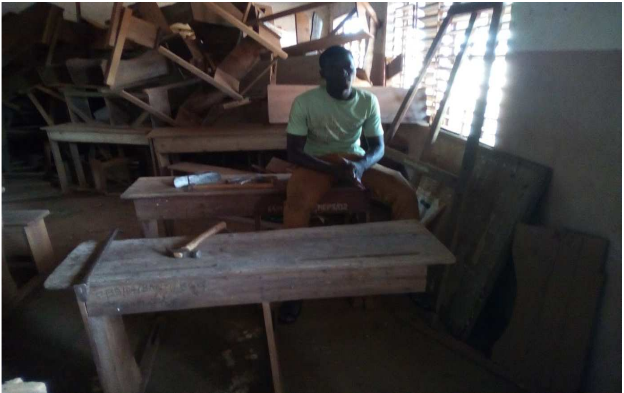
Carpenter hired to repair the desks of the CEG1 of Aplahoué